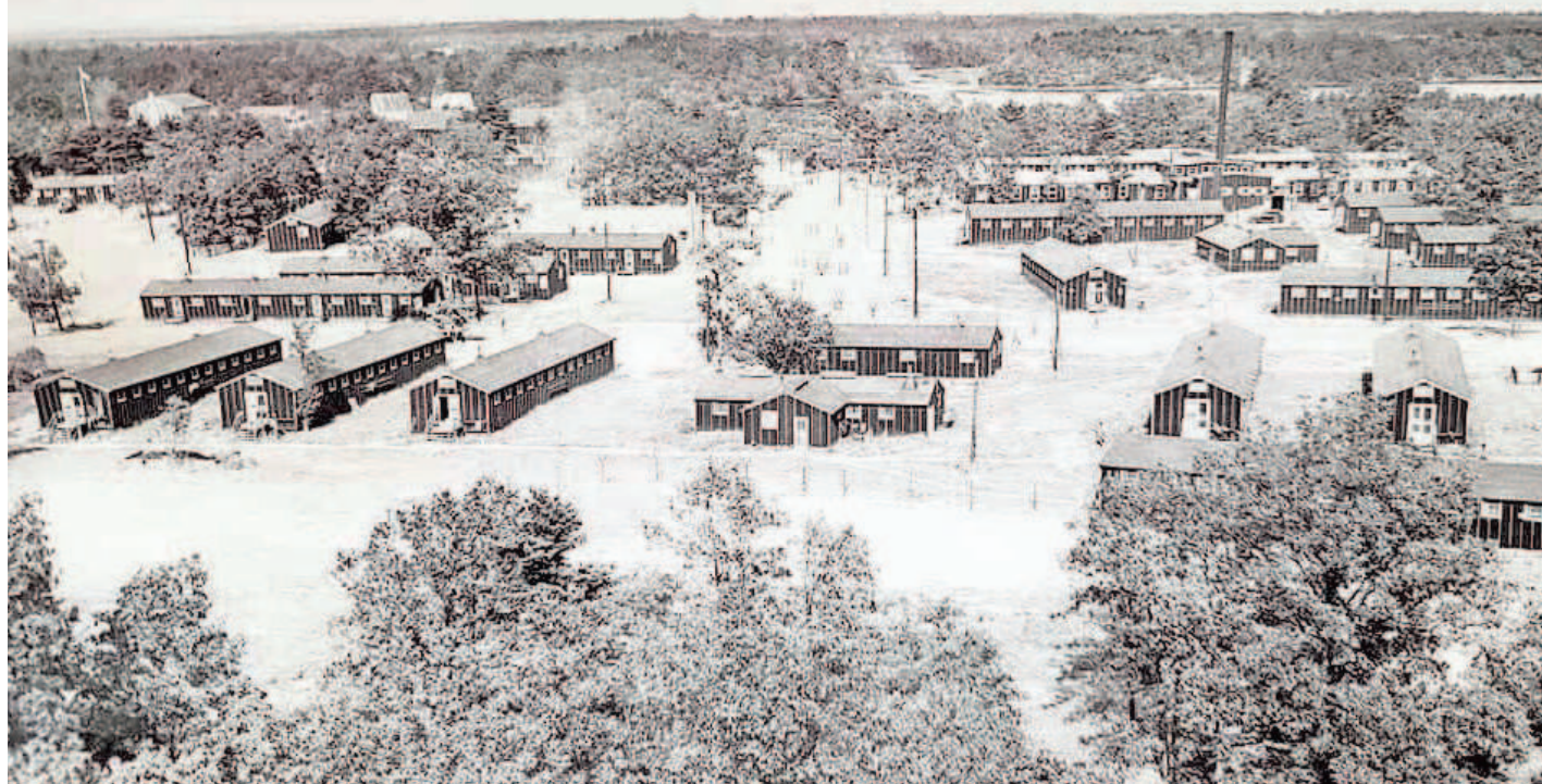
Camp Myles Standish in Taunton is pictured in September of 1945.

Camp Myles Standish was WWII POW camp, point of embarkation and more