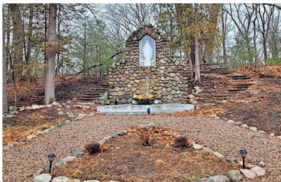
This grotto, on John Quincy Adams Road in the Myles Standish Industrial Park in Taunton, was built in 1943 by Italian co-belligerents held at Camp Myles Standish.